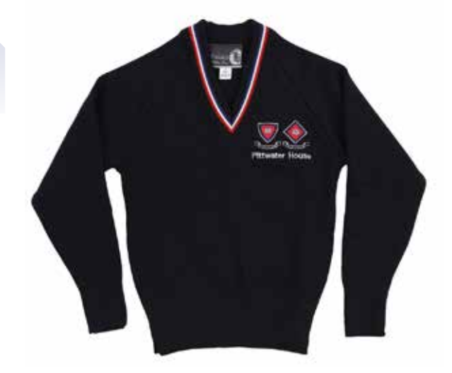
JUMPER Winter uniform includes Pittwater House regulation V-neck jumper