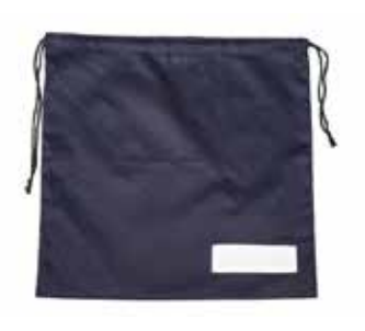
LIBRARY BAG The school regulation bags are required