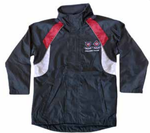
RAINCOAT Pittwater House raincoat is optional