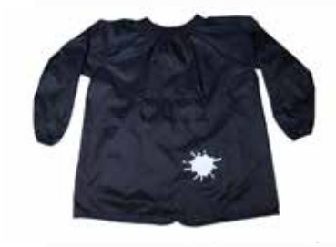
RAINCOAT/PONCHO A Pittwater House raincoat or poncho is optional