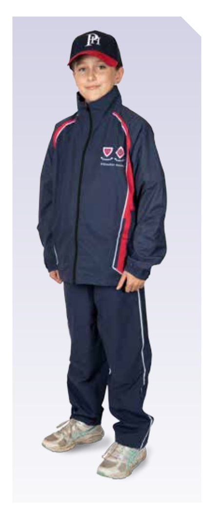
**Sports Uniforms should not be worn coming to school or going home from school unless permission has been granted.