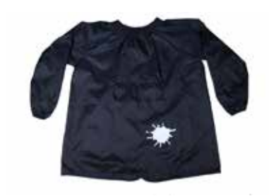
RAINCOAT/PONCHO A Pittwater House raincoat or poncho is opional