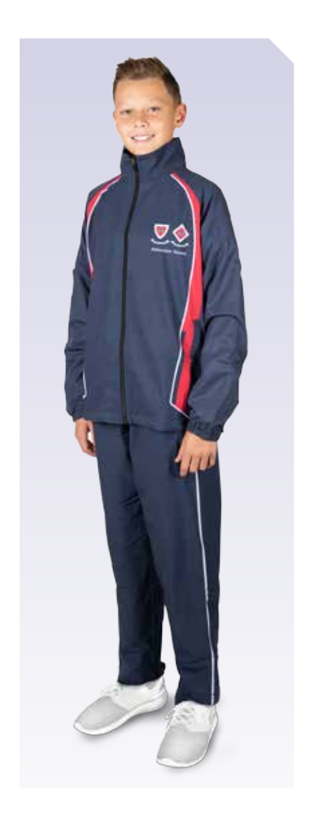
**Sports Uniforms should not be worn coming to school or going home unless permission has been granted.