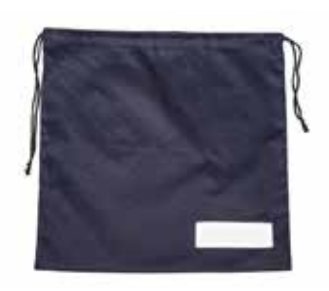
LIBRARY BAG The school regulation bags are required