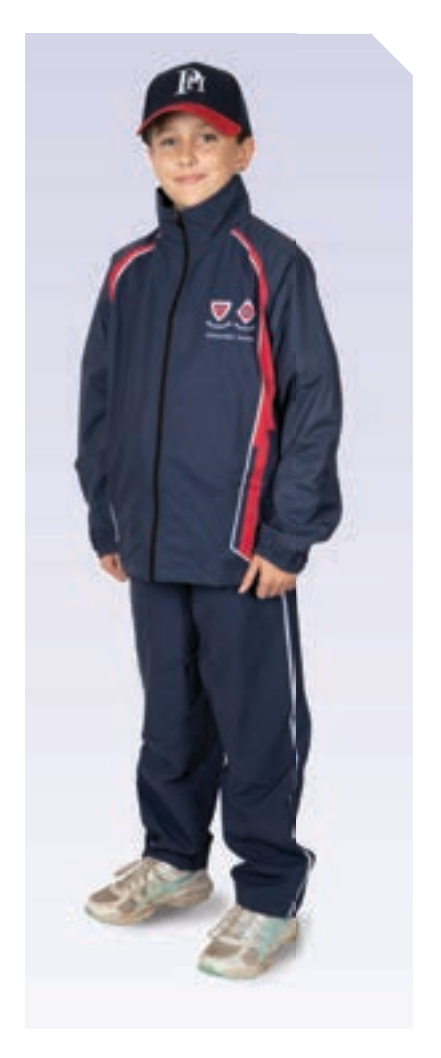
*Sports Uniforms should not be worn coming to school or going home from school unless permission has been granted.