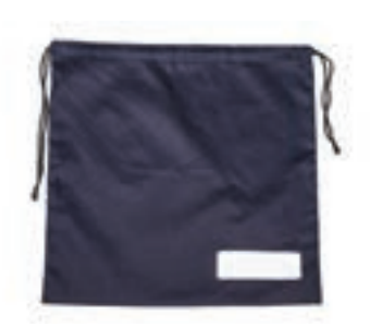
LIBRARY BAG The school regulation bags are required