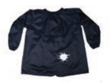
RAINCOAT/PONCHO A navy raincoat is mandatory. Branded Pittwater House rain jackets and plain navy ponchos available from the School Shop