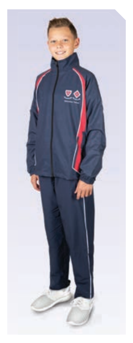
*Sports Uniforms should not be worn coming to school or going home unless permission has been granted.