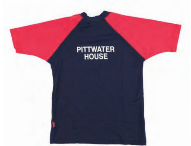
Rash vest (K-Y10)